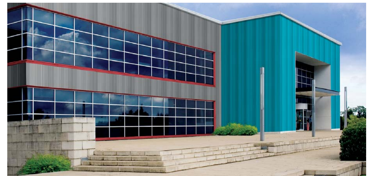
Ideal for large commercial applications. Make a statement with a variety of colour choices